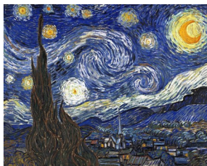
The Starry Night Vincent van Gogh I 1889.