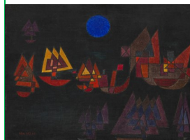
Ships in the dark Paul Klee 1927

Silhouette—a dark shape visible against a brighter background