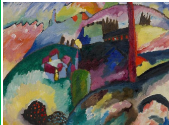
Landscape with factory chimney Wassily Kandinsky 1910