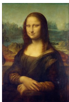
Leonardo da Vinci (1452—1519)