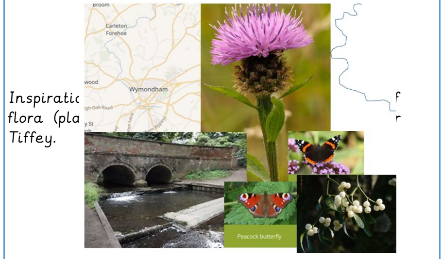
Inspirational flora (plants) of the River Tiffey.