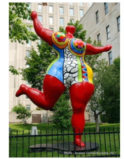
Artist: Niki de St Phalle Title: Nana dancing 2015