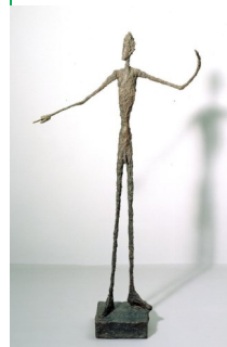
Artist: Alberto Giacometti Image 1: Man Pointing (1947) Image 2: Walking man (1960)