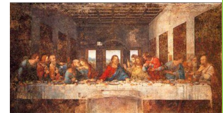
The Last Supper