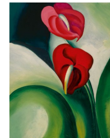
Georgia O'Keeffe Anthurium 1923 1887-1986—O'Keeffe was an American artist who painted hundreds of paintings of flowers.