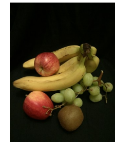
Still life An arrangement / drawing / painting / photograph of objects that have never had life or are dead.