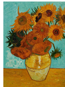
Sunflowers 1889 Vincent van Gogh 1853-1890 Van Gogh tried to show feelings in his art work