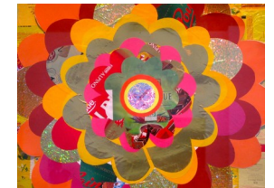
Henri Matisse (1869-1954) France